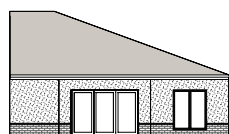
Typical South Elevation