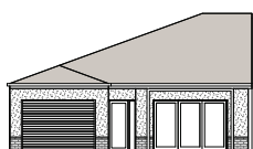
Typical North Elevation